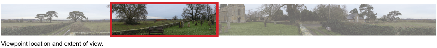
Viewpoint location and extent of view.